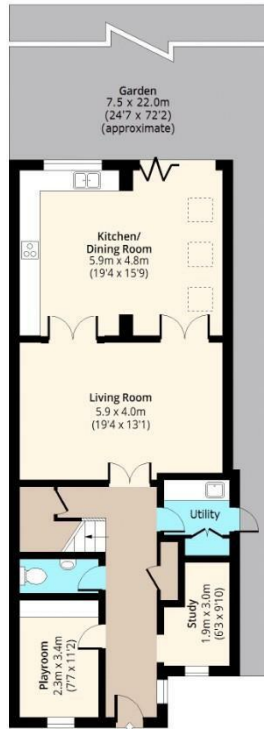
Ground Floor Approx. 92.06 Sq. meters (991 Sq. feet)