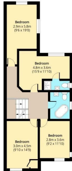
First Floor Approx. 77.85 Sq. meters (838 Sq. feet)